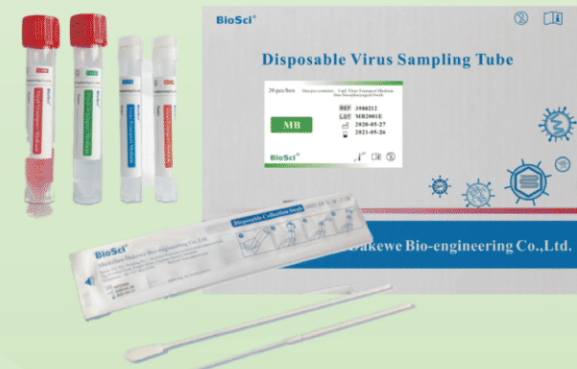
Dakewe BioSci Virus Transport Medium